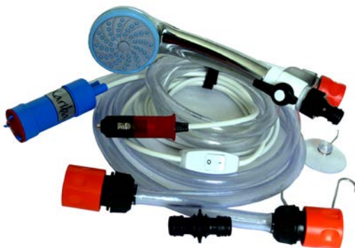
Standard: 4.1L Shower Pump Kit