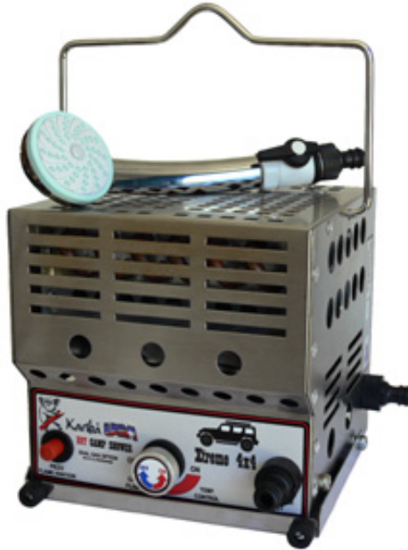
Legs folded for storage