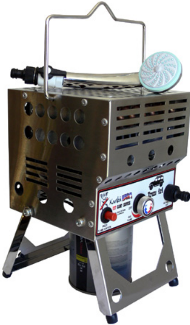
Powered by EN417 Gas Canister