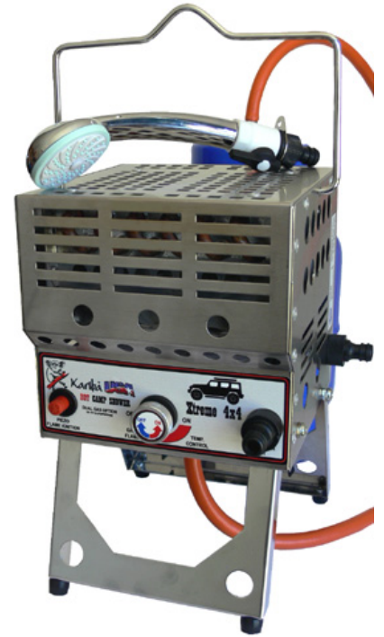
Powered by LP Gas/Propane