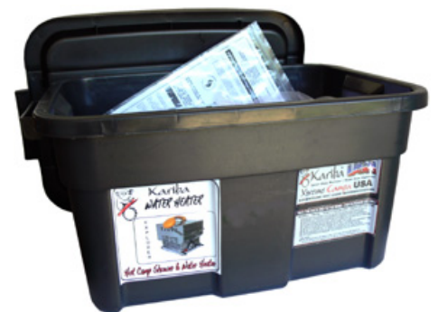
Standard: 30L Rough Tote Box