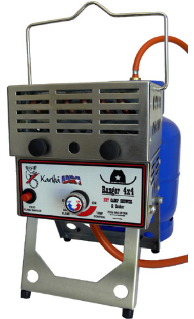
Powered by LP Gas/Propane