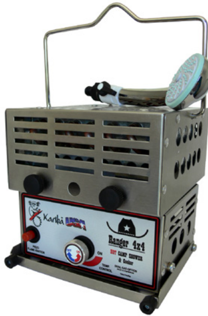
Legs folded for storage