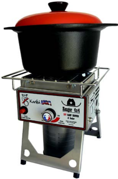
Powered by EN417 Gas Canister